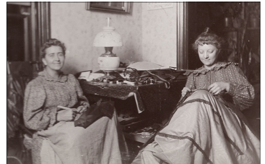
Young women doing hand work at home circa 1900 (above) and young ladies learning typing at the Vo-tech in 1968 (below) represent the changes in what was expected of girls and women, a topic addressed in both the traveling exhibit and the Speaker's Bureau program An Accomplished Young Lady .